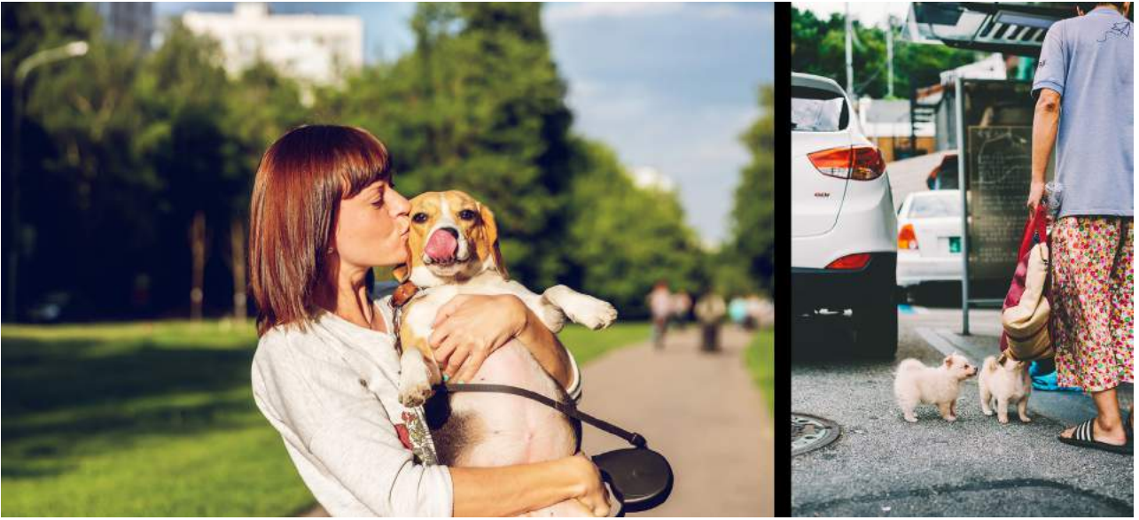
Image 003 – Photograph (L) by Artem Beliaikin and Photograph (R) by Bundo Kim .

Let's say that you know the story you want to tell with your pet picture. The second step is to make creative decisions in the shooting process that highlight that story.