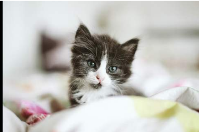
Image 005

Here is an essential distinction in pet photography. An excellent pet portrait does not necessarily tell a great story.